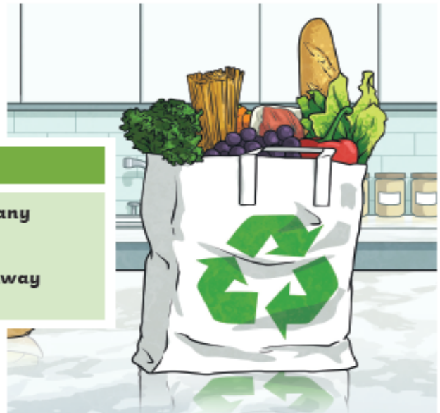
Illustration: A paper shopping bag.