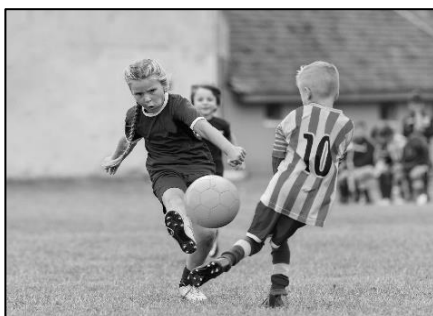
Task 3 - Visual Prompt 3

Teacher is to use one visual prompt per student.