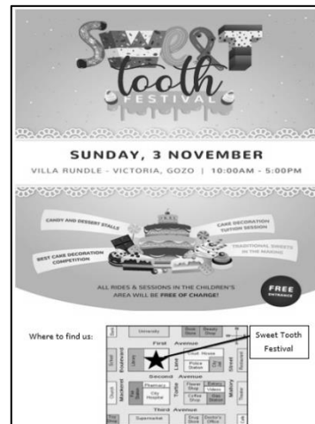
Task 2 - Visual Prompt 2