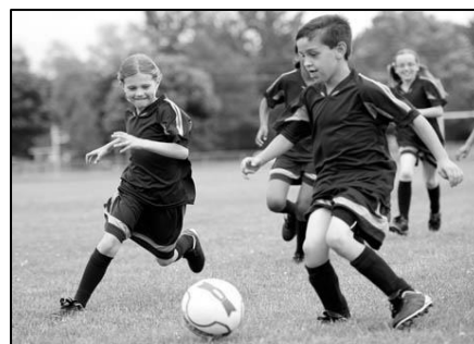
Task 3 - Visual Prompt 4